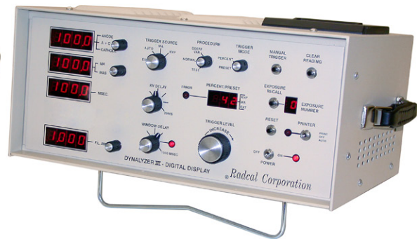
Dynalyzer III Digital Display / Printer