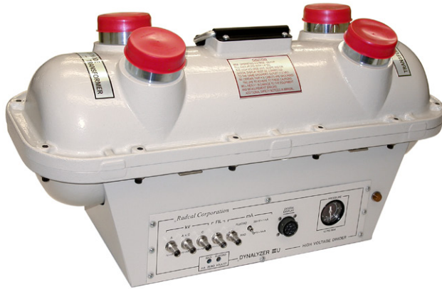
Dynalyzer IIIU High Voltage Unit